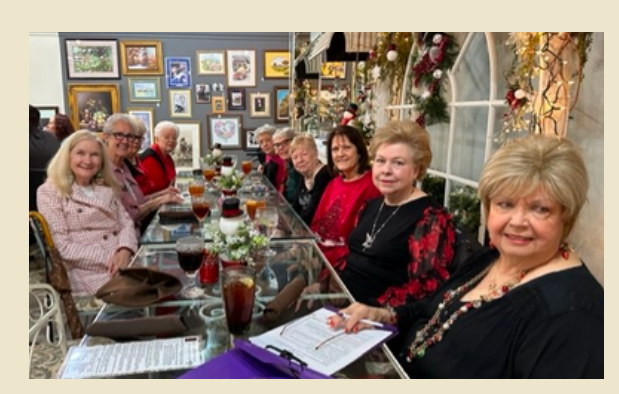
Beta members at Chocolate Angel

Beta members bought books for the Collin County Children's Advocacy Center as their December altruistic project. They then enjoyed lunch at Chocolate Angel in Plano.