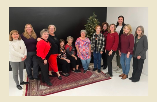
Texas Gamma Xi