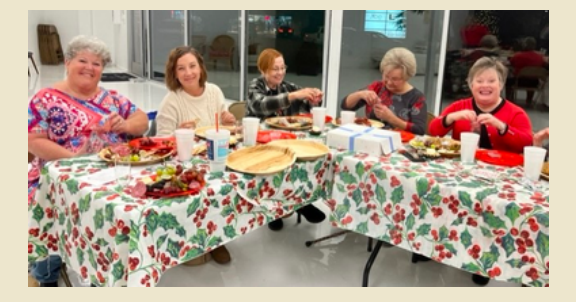
Gamma Xi sisters met at Solomons Studio in Arlington and enjoyed creating Christmas charcuterie boards.