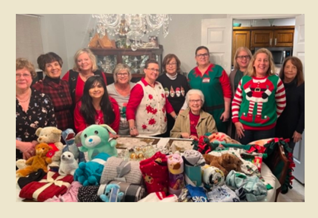
The Epsilon Pi sisters met and shared a meal and "favorite things" gifts. The highlight of the night was the donation to CAC: blankets, pajamas and stuffed animals donated to children in need.